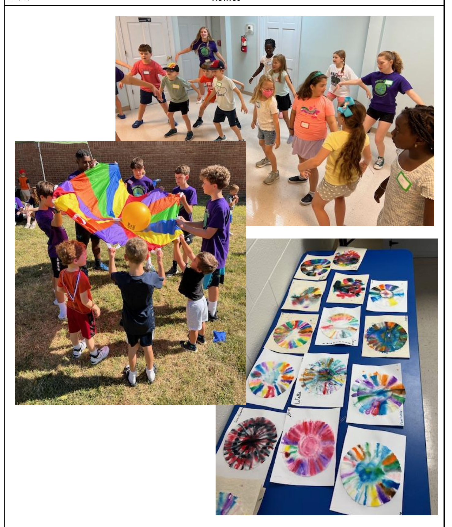
More VBS Pictures