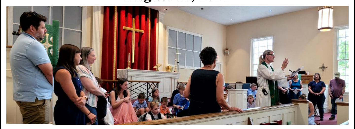
Each participant received a Holy Trinity name tag for their backpack.